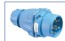
Male Inlet with Handle (Plug) 31-38940 + FH611

A typical order should include an inlet part number, a receptacle part number AND the matching handles, angles or other required accessories.