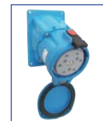
Female Receptacle with Angle Adapter 31-34940 + MP6